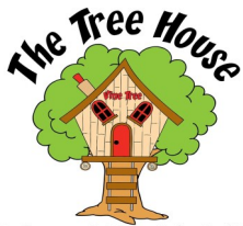
Before and After School Club